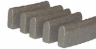
Roof segments 25-500 mm