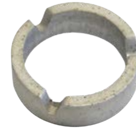
Ring segments 10-50 mm