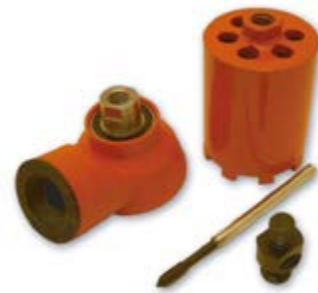
Drill swivel for sucking off the dust by standard industrial vac