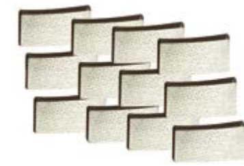
Galaxy segments systematic diamond arrangement