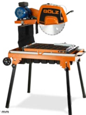
BS400E / P