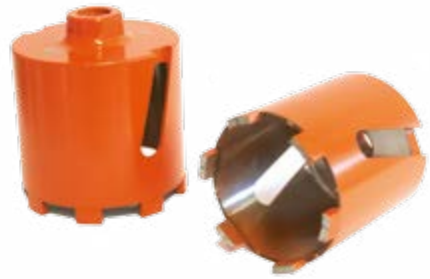
Dry Drilling System without hammer for joint boxes