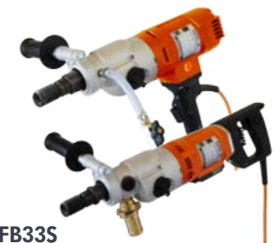
FB33P / FB33S

2-Speed Heavy Duty Hand Held Core Drill. Compact Core Drill for anchor and installation holes