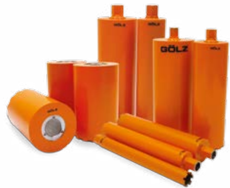
Diamond Drill Bits 1¼" UNC