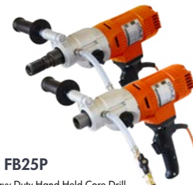
FB23P / FB25P

For several applications as fixings, installations and openings for gas, water, heating and air supplies.