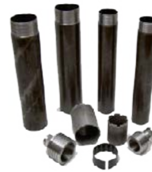
Deep drilling system with or without core lifter