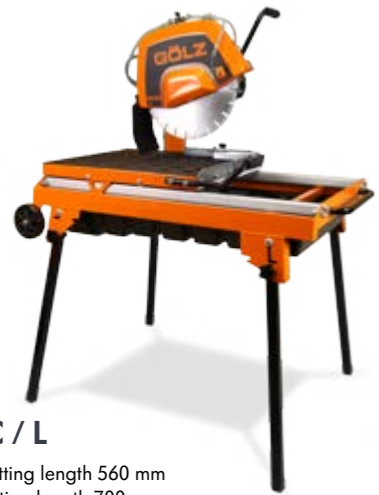
MS350C / L

MS350C - Cutting length 560 mm MS350L - Cutting length 700 mm Blade Ø 350 mm