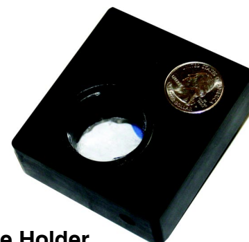
Small Quantity Sample Holder (Quarter Shown for Scale)